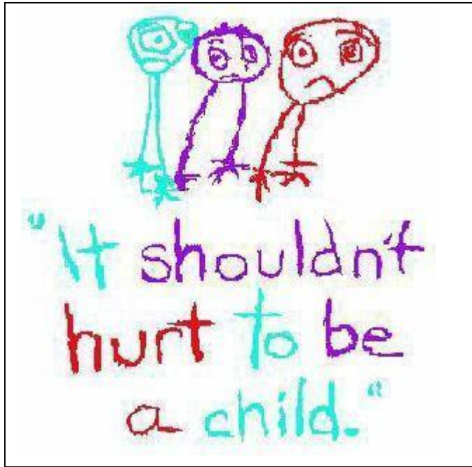
Document 2: A Drawing Illustrating a Cause

A- Look at document 2 and answer the questions that follow: